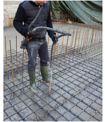
Light weight and effective